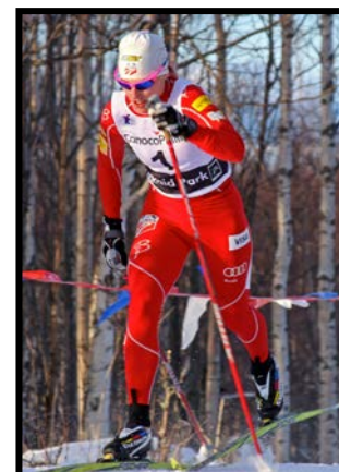
Kikkan Randall racing in Anchorage, 2008